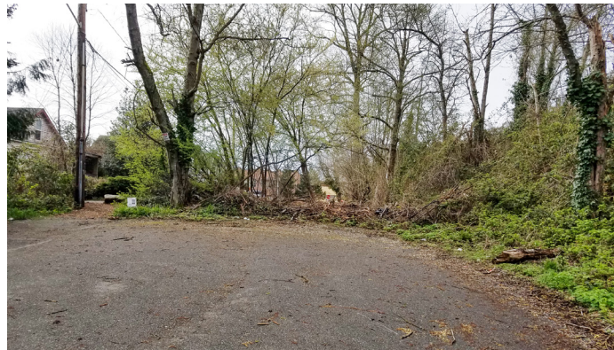
Existing unimproved walkway on 26th Ave SW at SW Trenton St

In 2016, the Chief Sealth High School Walkway project was one of 12 selected by the Levy to Move Seattle Oversight Committee to be funded through the SDOT's Neighborhood Street Fund (NSF) program. The NSF program funds projects requested by the community.