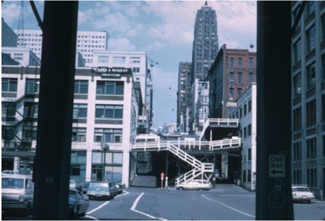
Looking east from underneath the Alaskan Way Viaduct, c. 1966

The most popular image on SMA's Flickr site in the past three months is a 1960's view from underneath the Alaskan Way Viaduct looking east towards where the Harbor Steps now stand.