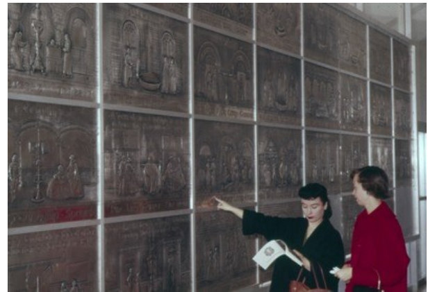
Visitors at City Light's history of electricity display, December 1965. Item 177123 , and City Light Facilities building cafeteria, January 1961. Item 177127 , Seattle Municipal Archives