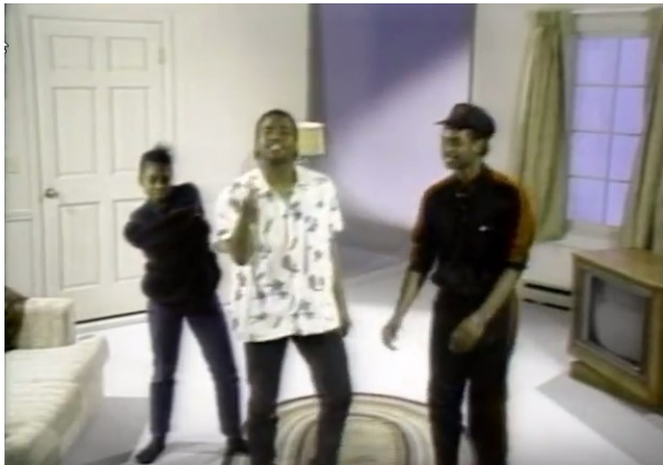
"Reduce Your Chills and Cut Your Bills," 1987.

One of the most popular items on YouTube continues to be "Reduce Your Chills and Cut your Bills," a public service announcement created by Seattle City Light in 1987. It includes lyrics by Sir Mix-A-Lot and dancers from Madrona Youth Theater.